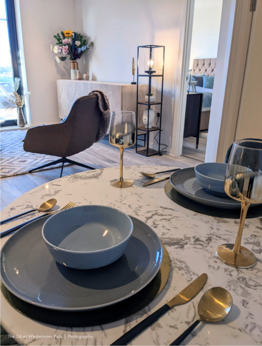
The 56 at Westminster Park | Photography