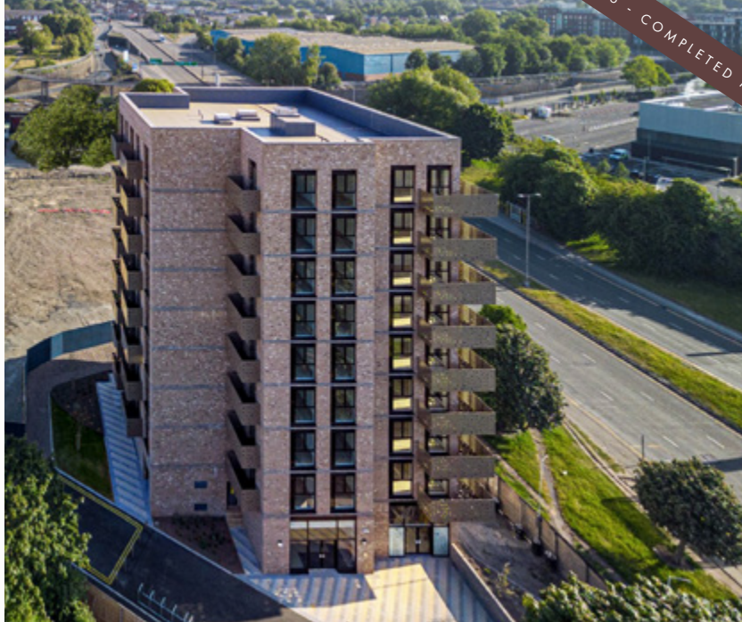
THE 56 - COMPLETED MAY 2023