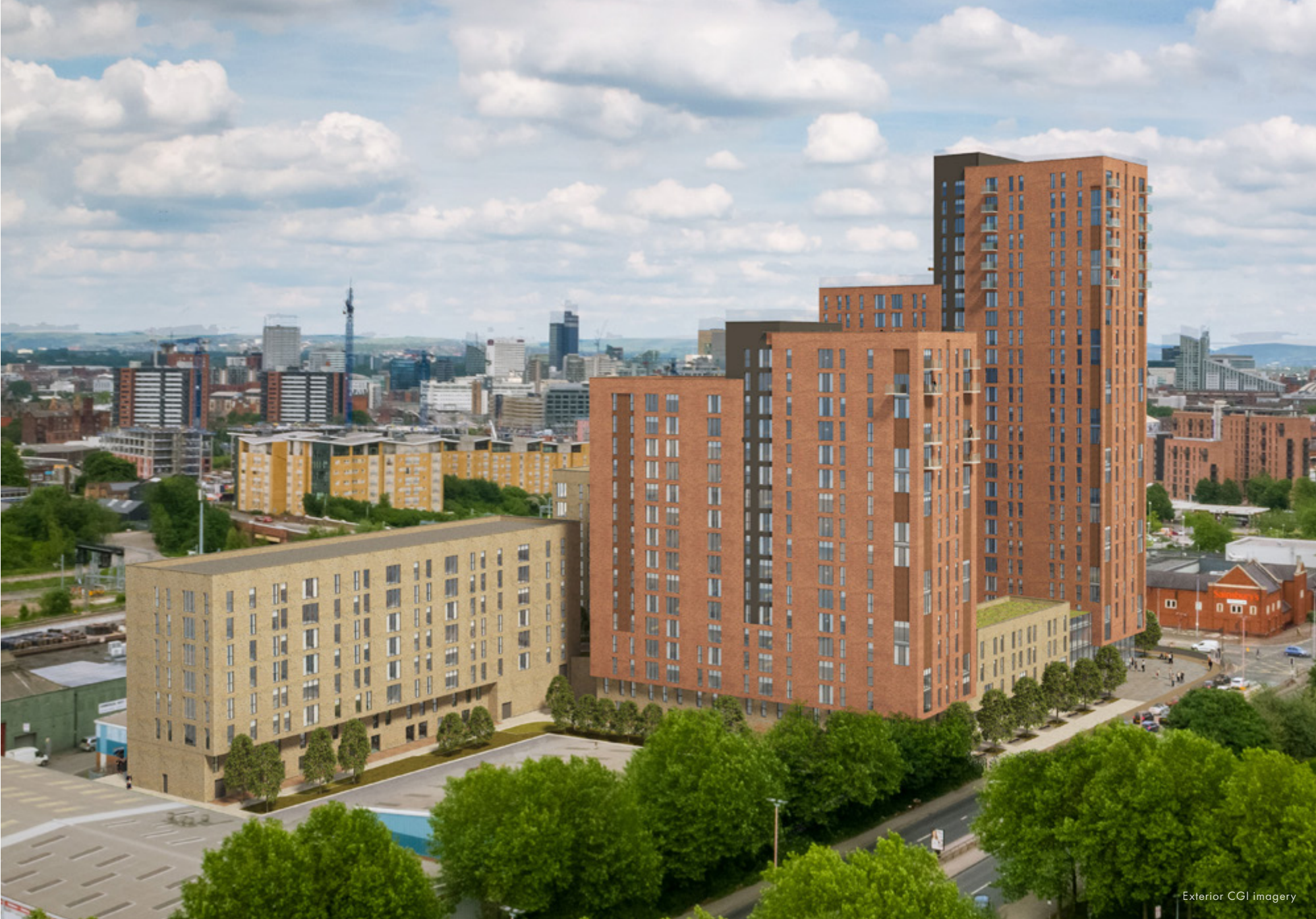
Exterior CGI imagery